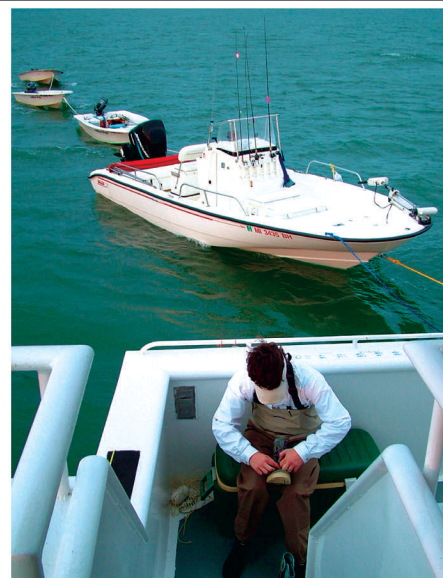
The Southern Way carries a fleet of boats. Guests can use these skiffs to fish and explore, or they can tow their own behind the mothership.

I wedged myself into neoprene waders, grabbed my camera and stepped into a skiff. I was surprised to find that it had already been packed with rods, reels, ice, drinks, a map of the area’s hot spots,