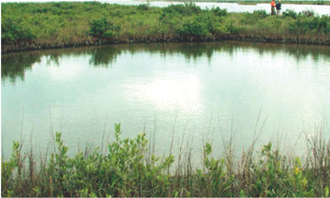
Cuts and winding bayous connect the sound and Gulf.